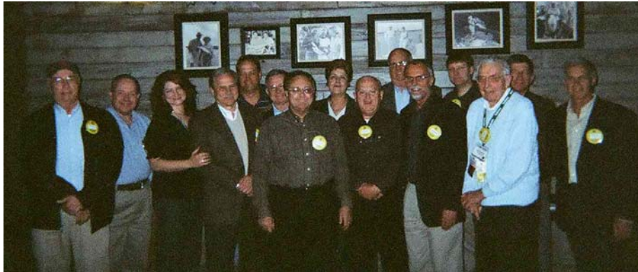
Past Presidents are honored during the March Meeting.