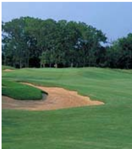
Clary Fields Hole Number 3