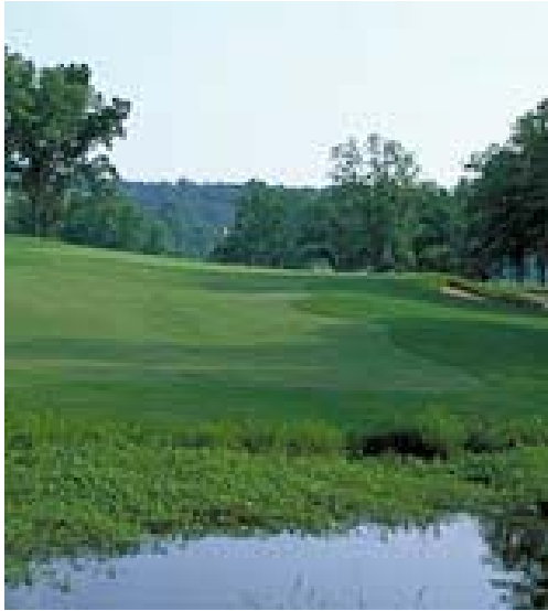
Clary Fields Hole Number 15